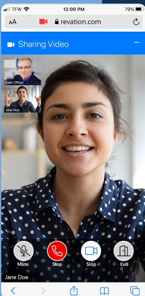
LINKLIVE SESSION ON SMARTPHONE/ MOBILE DEVICE